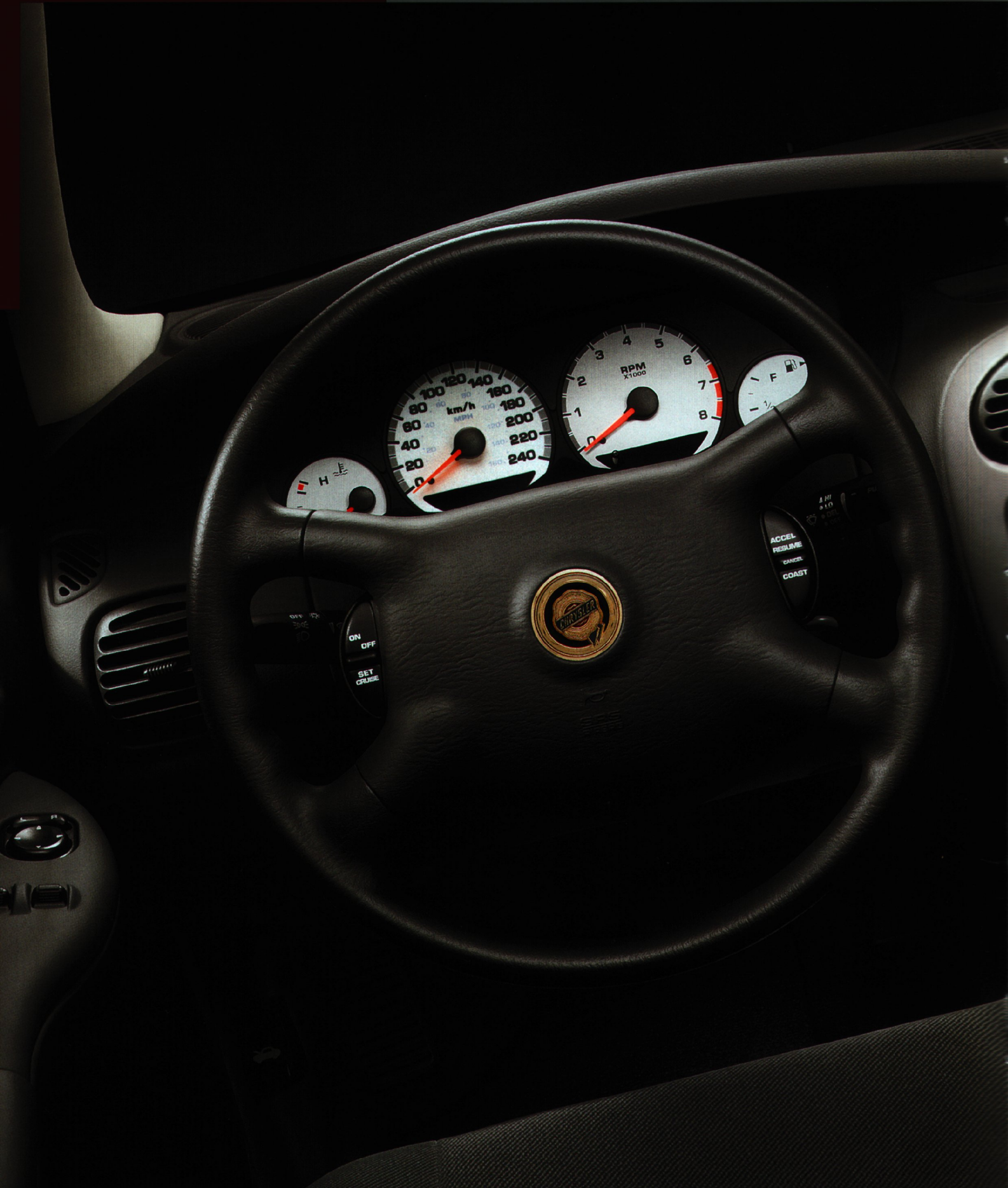
Chrysler Neon LX interior shown in Agate.