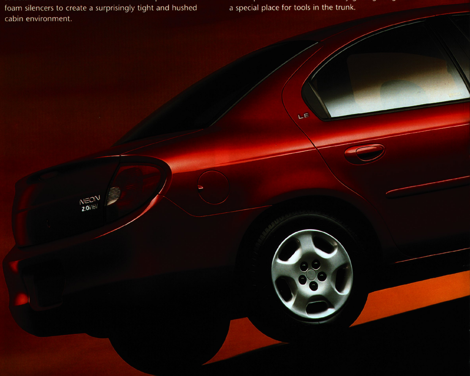
Chrysler Neon LE shown in Salsa Red Metallic.

Smart. Neon is full of intelligent features for life on the go. Theatre-style lighting dims on cue 30 seconds after the last door is closed, or immediately once you start the engine. And, if you accidentally turn the key again, a double-start override system disengages the starter to prevent damage. Neon also accommodates all of life's little things – coins, cell phones, sunglasses, letters, CDs, tissues, maps... everything has its place. There's even a handy garbage bag hook and a special place for tools in the trunk.