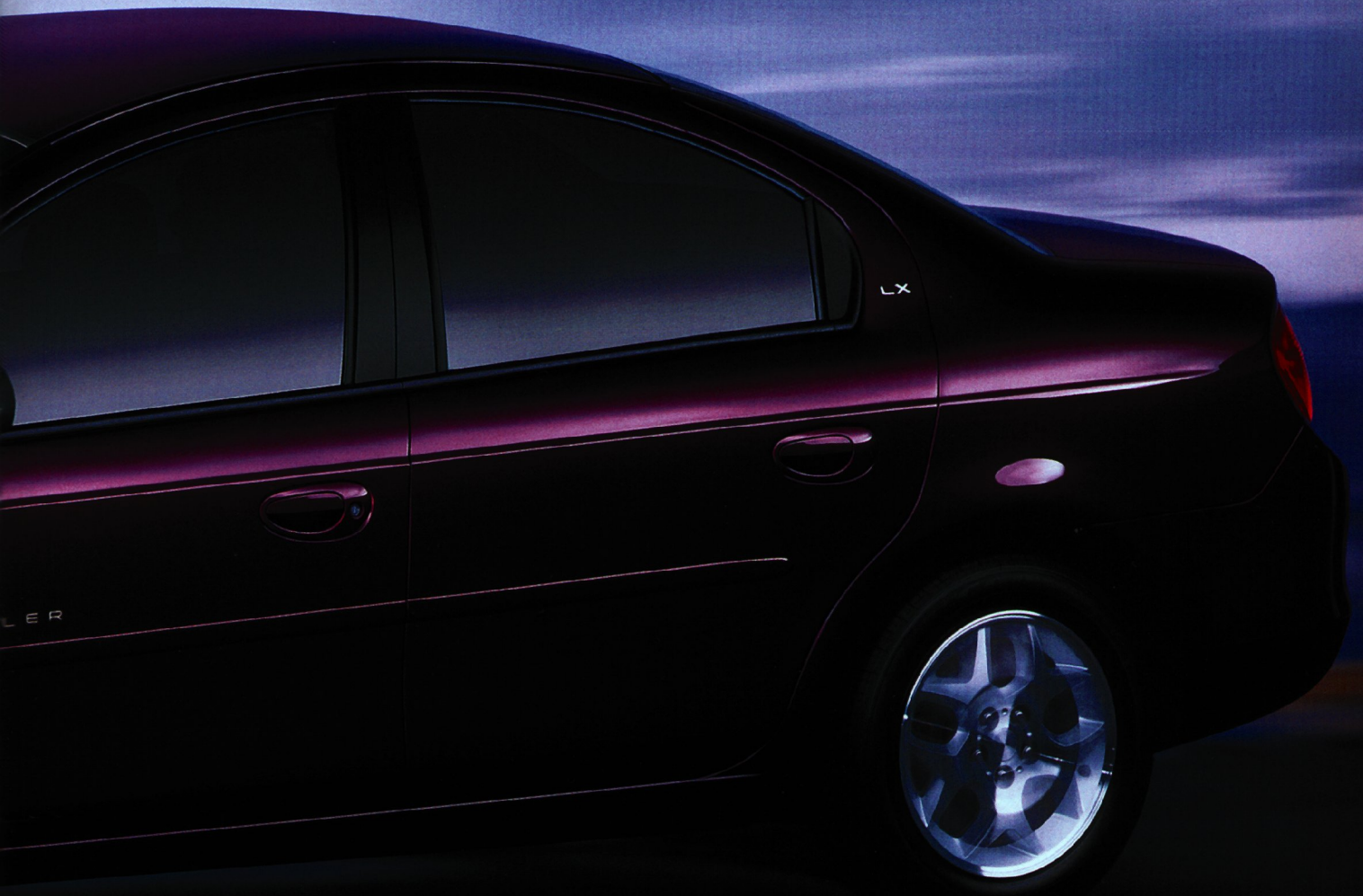
Chrysler Neon LX shown in Deep Cranberry Pearl Coat.